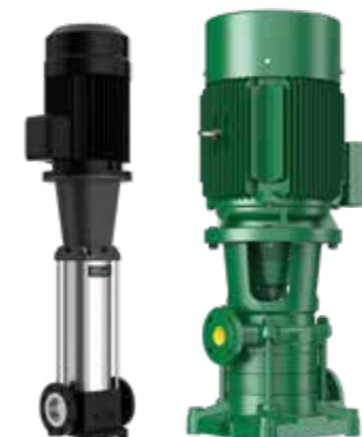
Vertical multistage electric pumps