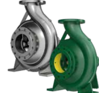
EN733 Normalized pumps