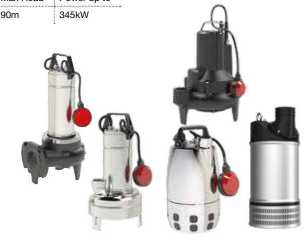
Submersible pumps for drainage and sewage