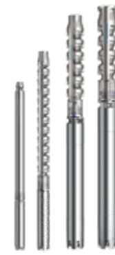
6" ÷ 12" Borehole pumps - ENDURANCE in high precision casted stainless steel