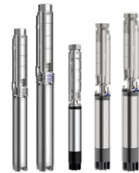
6" ÷ 10" Borehole pumps in stamped stainless steel