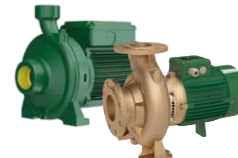
Horizontal monobloc electric pumps